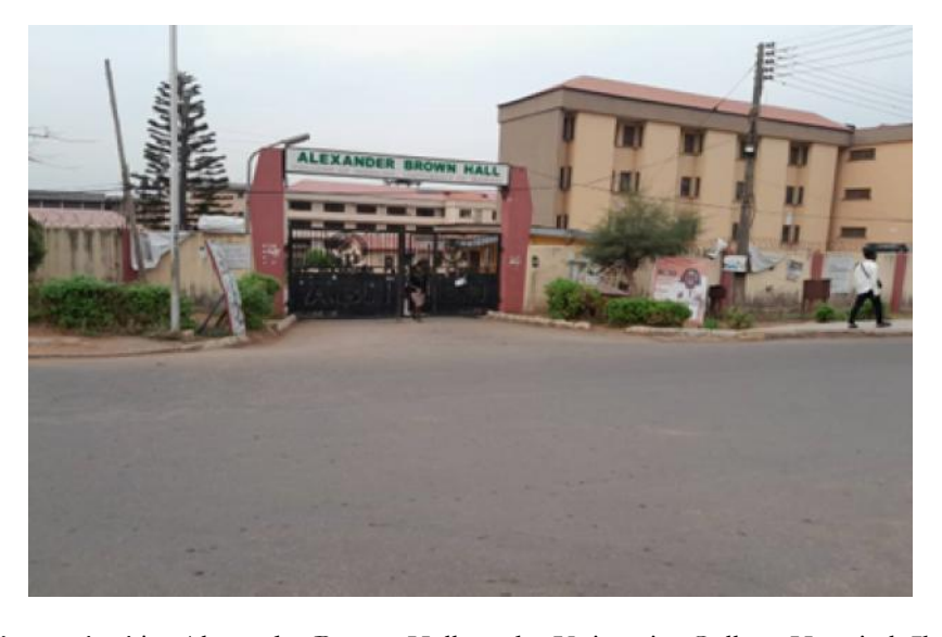
Photo by the Medical Illustration Unit, University College Hospital, Ibadan, Nigeria. (Source-Reference 10)