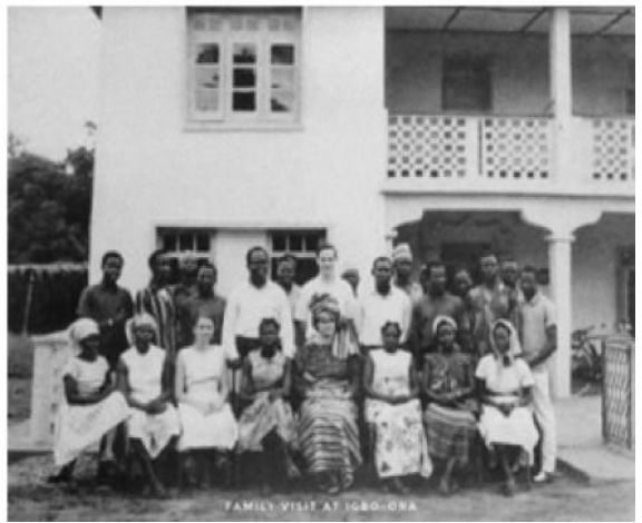
Fig. 2A Fig. 2B